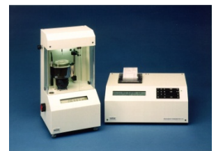
Force Tensiometer – K12