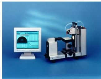
Drop Shape Analysis System DSA10

Keywords: medicine, biocompatibility, contact angle, surface free energy, surface activation